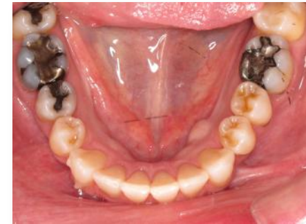
PROGRESS PHOTOS 2