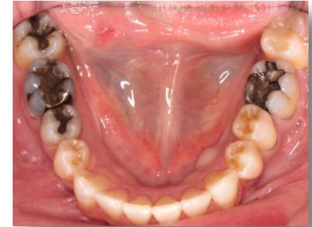
PROGRESS PHOTOS 1